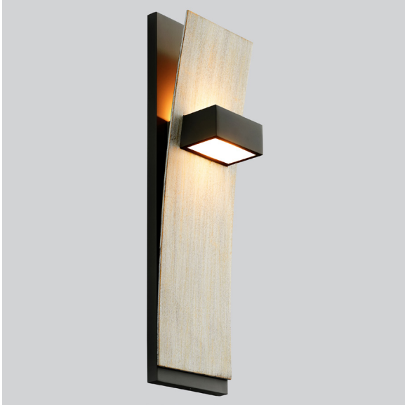
-1541 Black/Weathered Oak