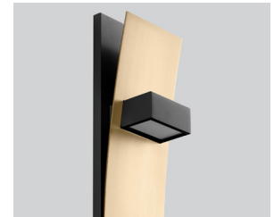
-1540 Black/Aged Brass