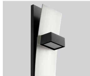
-1524 Black/Satin Nickel